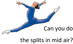
Can you do the splits in mid air?

Can you do 10 star jumps or can you manage 20?